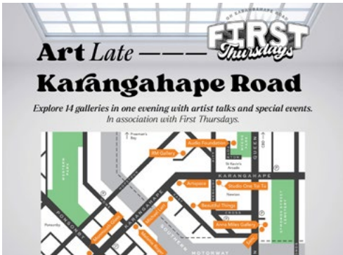
ART LATE IMAGE

Running alongside First Thursday's on June 1st is Auckland's longstanding Queers & Wares market - a space that sets out to showcase the talents of Auckland's lgbtqia community. With an ever changing variety of stalls it's a fresh and unique market that pairs perfectly with the surrounding events on Karangahape Road.