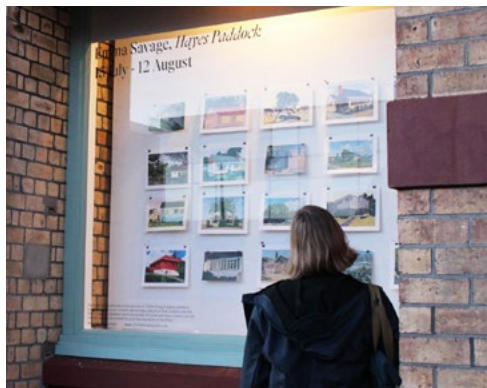
EMMA SAVAGE, 2021