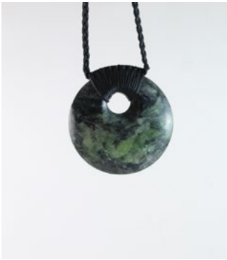
AOTEAROA BONE & STONE

WHEN SUN 16 JUL 10AM - 6PM WHERE 1 HOPETOUN STREET COST $60 CLASS 10 MAX MATERIALS INCLUDED ENROL: FULL