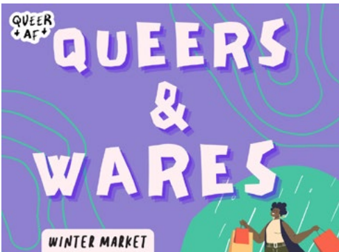
QUEERS & WARES

WHEN THU 1 JUN 5PM - 8PM WHERE GEORGE COURT FOYER 238 KARANGAHAPE ROAD